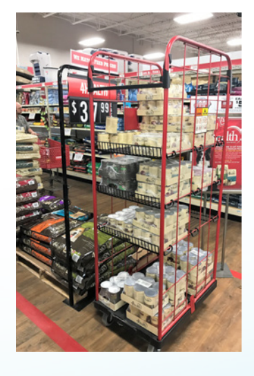
Three-tablet version used in the transport and merchandising of food containers.