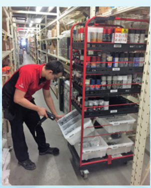
Makes it easy to find the products you are looking for in the warehouse and to know the inventory.