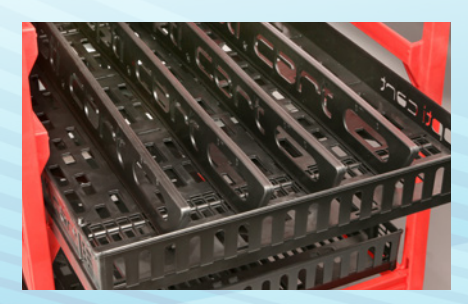
Each tablet has several dividers that facilitate the transport of single served of different sizes.