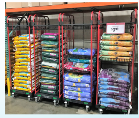
Version, a tablet used in a pet food store.