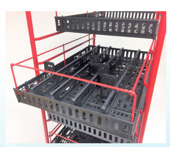
The side walls prevent the bottles from tipping sideways, forwards or backwards.