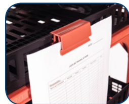
Plastic clip that fits at the front of the drawer can hold a work sheet, work schedule or products identification.