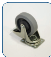
With four swivel wheels, the DK-OPTICART is easy to move within the small back store aisles.