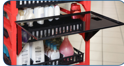
An additional foldable shelf can easily be installed on the DK-OPTICART, thus providing team members a workspace.