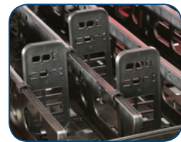
The plastic stopper prevents the products from falling over when the row is not full and assists in organizing similar products.