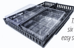
The cosmetic tray has six compartments for easy storage.