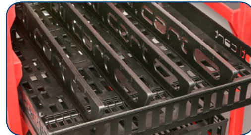
Each shelf has several adjustable dividers which make it easier to transport containers of different sizes.