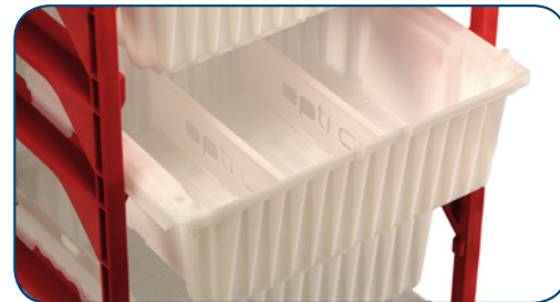
The white bin, which can be used on a conveyor due to its non-slip bottom, and comes with two adjustable dividers.